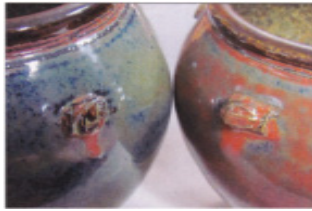
Same glaze: the left bowl had a thinner application and 14 hours firing. The right bowl had a thicker application and faster firing (9 hours).