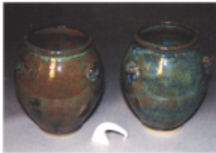
The same glaze can look different when applied on different clay bodies. Iron in the darker clay (left) reacted with the glaze and changed its color.