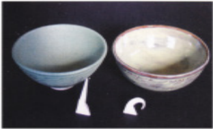
Many gloss glazes look matte (left) when underfired.

Great results are always what we hope for when opening the kiln after firing, but sometimes it just doesn't happen. Figuring out what happened can be difficult, but these tips might help answer some common questions.