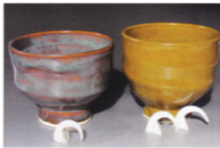
Some glazes that contain iron can change color if fired twice. The extended heat work changes the color and sometimes the surface too.